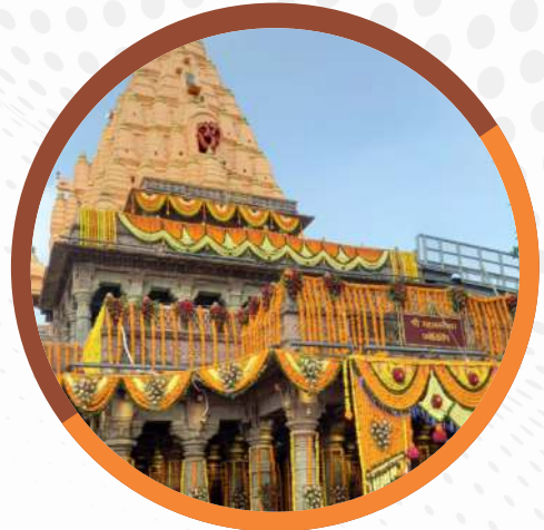
Ujjain Maheshwar Temple