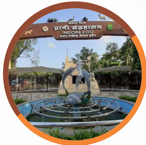
Kamla Nehru Prani Sangrahalaya