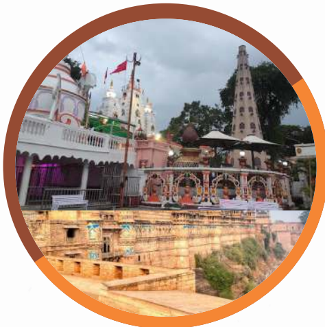
Khajrana Ganesh Mandir