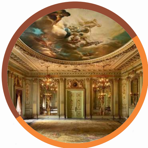
Lal Bagh Palace