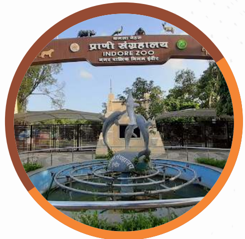
Kamla Nehru Prani Sangrahalaya